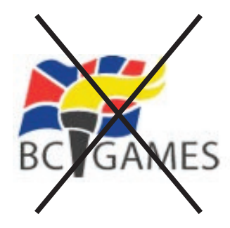
Do not print the logo in a low resolution format.