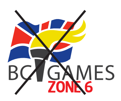
Do not add text to the logo.