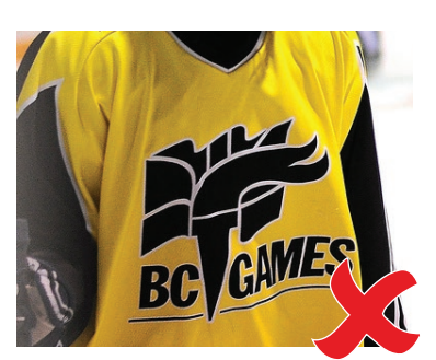
Do not exceed the maximum or minimum size.