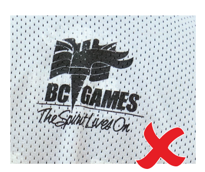
Use the most current version of the logo. Do not use outdated versions of the logo.