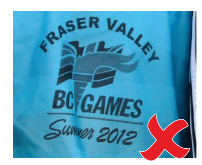
Do not add text to the logo.