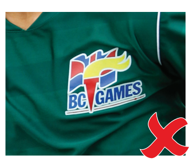
Do not add shadows or outlines to the logo.