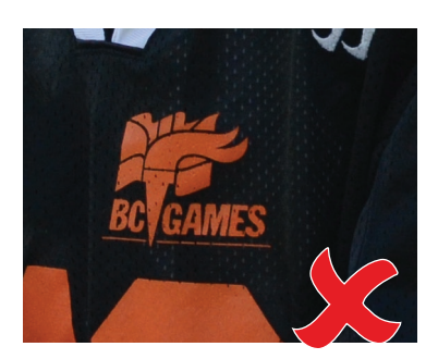
Do not change the colour of the logo .