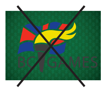
Do not print the logo on a patterned or distracting background.