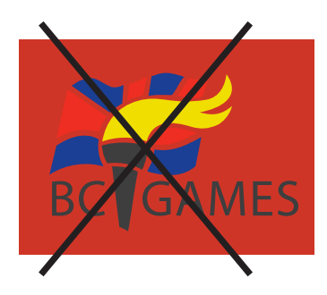
Do not print the full colour logo on a colour that matches or clashes. Use the black, white, or greyscale version.